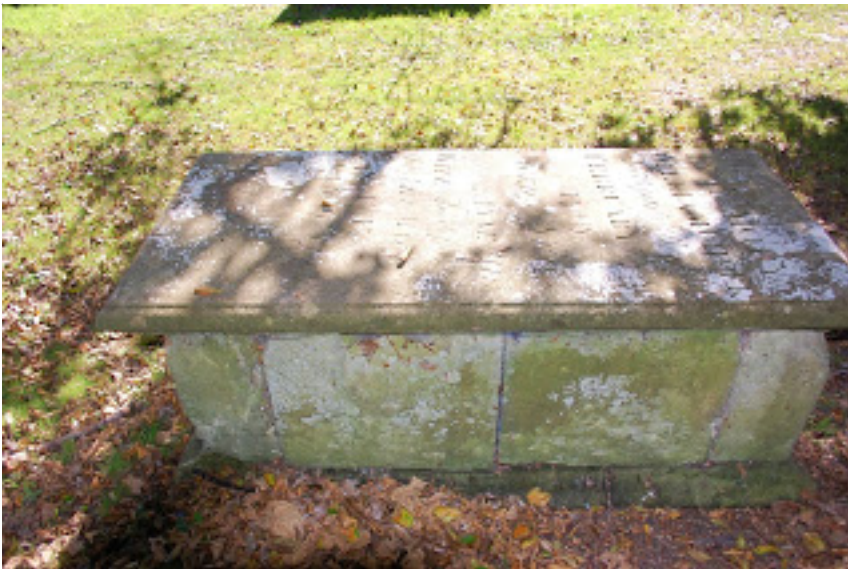
The Cheek Mausoleum

inside, drawing the slab back over them. There they stayed while Revenue patrols, apparently previously alerted, searched fruitlessly for them, before eventually giving up. The smugglers, unsure that the patrols had gone, remained inside the tomb until dawn. Hoping the coast was clear, they pulled back the slab and started to clamber out – just as the hapless sexton, Mr Long, arrived for